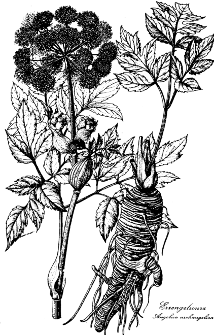
Erangelicorum Angelica archangelica